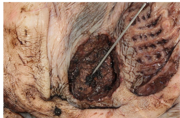
Fig. 2 Compartment, close-up of ulcer; probe showing approx. 2 mm in diameter disruption. The raised rim wall indicates the chronicity of the inflammation.

Gastric ulcers have also been reported to be associated with reflux of duodenal fluid [33] and in connection with Eimeria macusaniensis infections [34]. Gastric ulcers in